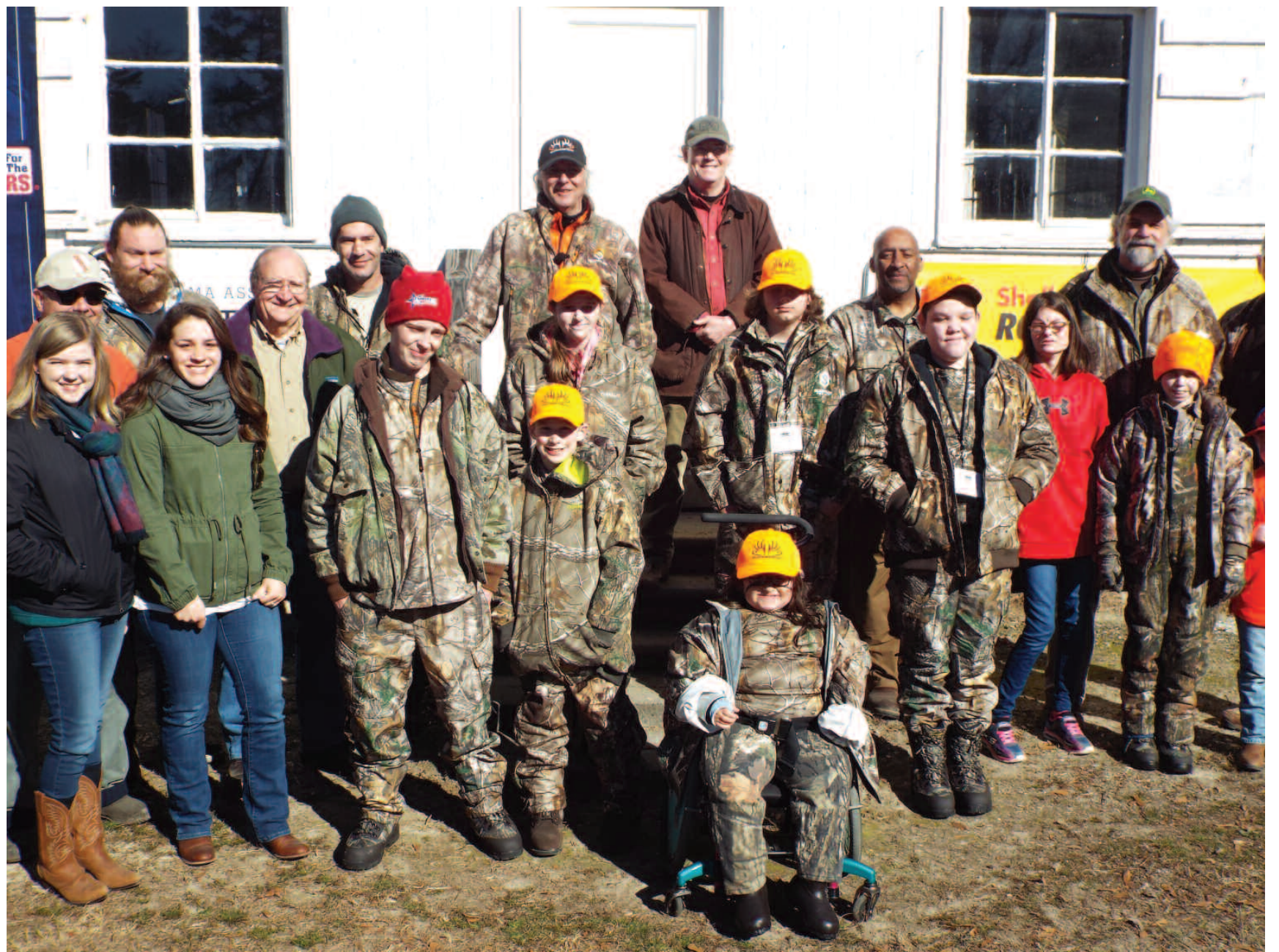
All the participants in the Buckmasters Life Hunt (nine kids and two wounded warriors) gather for a photo opportunity.

She will receive her mount in September of this year at the Buckmasters chapter in Iron Mountain, MI.