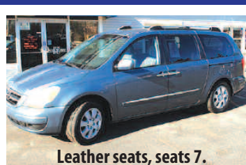
2007 Hyundai Entourage Ltd.