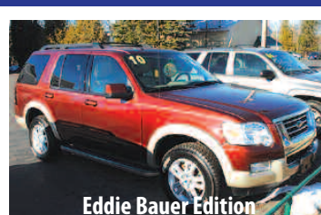
2010 Ford Explorer 4x4