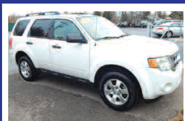
2010 Ford Escape