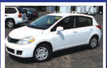
2010 Nissan Versa