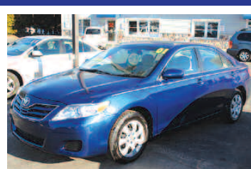
2010 Toyota Camry