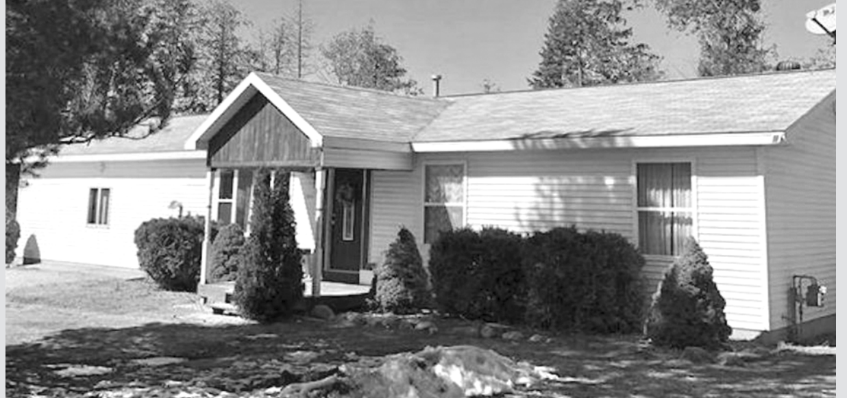
This perfect year round or vacation home with a great location is at 07373 Rogers Road south of East Jordan. It is listed at just $134,900.

Outdoors, enjoy your own private one acre retreat that backs to the Little Traverse Conservancy. The property is within walking distance to the Jordan River and is also close to snowmobile trails. All this and the shopping, dining and recreation possibilities in East Jordan is just a short drive away.