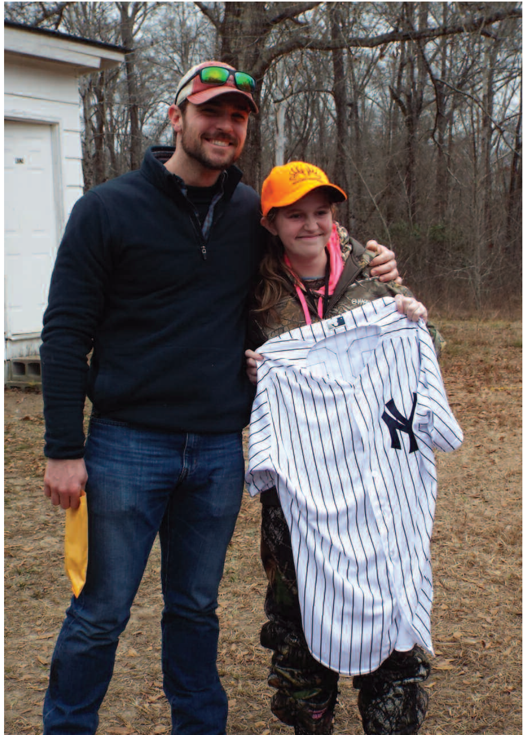
New York Yankees relief pitcher, David Robertson handed out autographed jerseys among other memorabilia to each of the 11 individuals selected for the Life Hunt.

The hunt is scheduled to air on TV in July. For more information on this incredible experience, please visit the Buckmasters website at: www.buckmasters.com