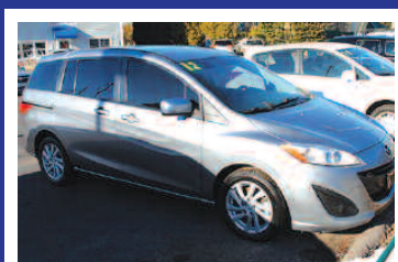
2012 Mazda 5 Van