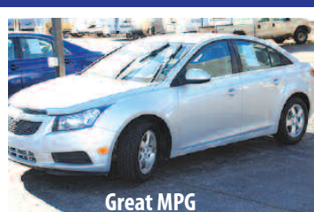
2011 Chevy Cruze LT