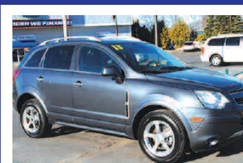
2013 Chevy Captiva LT