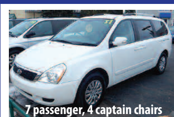
2012 Kia Sedona