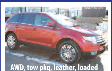
2008 Ford Edge Limited